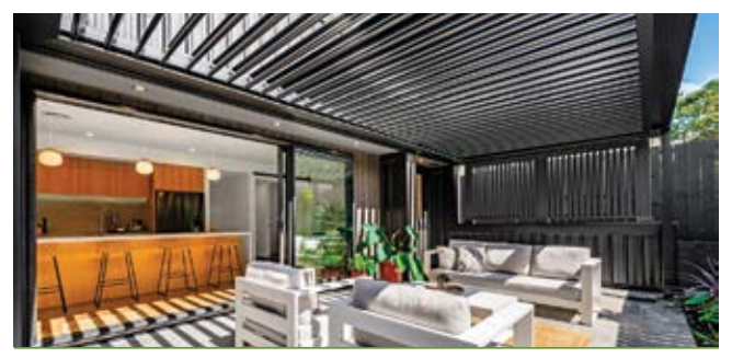
Create your Outdoor Room Contact us today for your free measure and quotation

If you would like to become an umpire, please contact one of the above umpires.